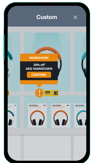
Single Scanning | MatrixScan AR | MatrixScan