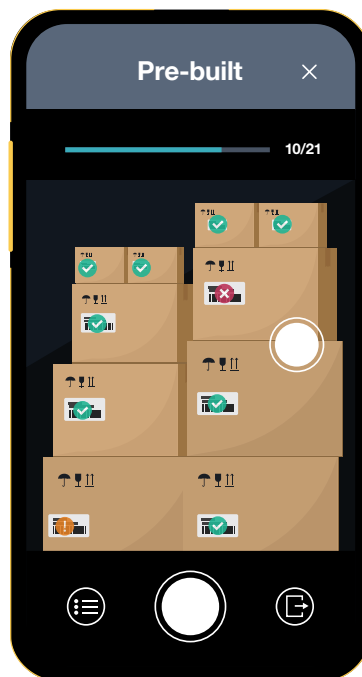
SparkScan | MatrixScan Find | MatrixScan Count